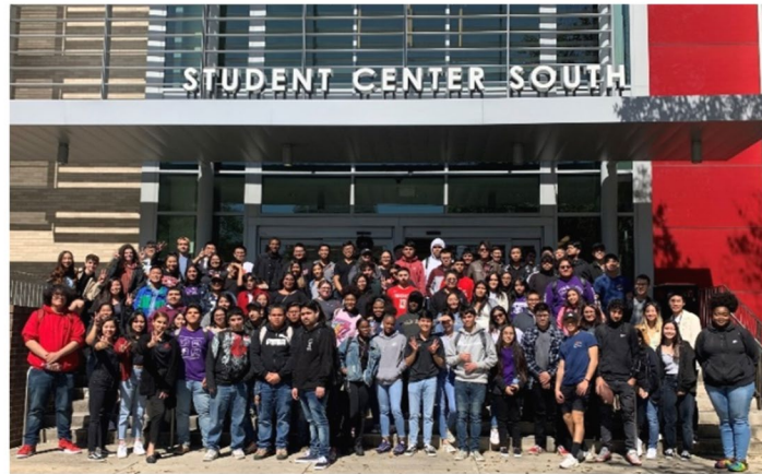
Students attended a technology workshop at the University of Houston, February 2020

November 12- Financial Aid Workshop 5:00p.m.- 7:30 p.m. : Seniors can register for FAFSA advising sessions with an adviser from the College Readiness Team.